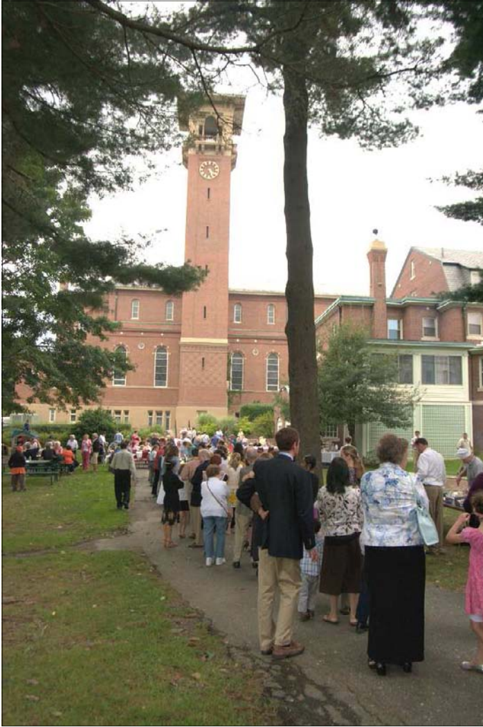
(Front Cover: The beginning of our parish picnic last Sunday, September 9th, 2012.)