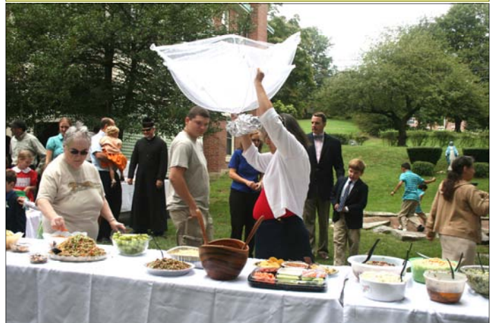
Today's bulletin shows scenes from this year's end-of-summer all-parish picnic.

SECOND COLLECTION FOR TODAY : SOS (DOCTORS) MISSIONARY APPEAL CO-OPERATIVE