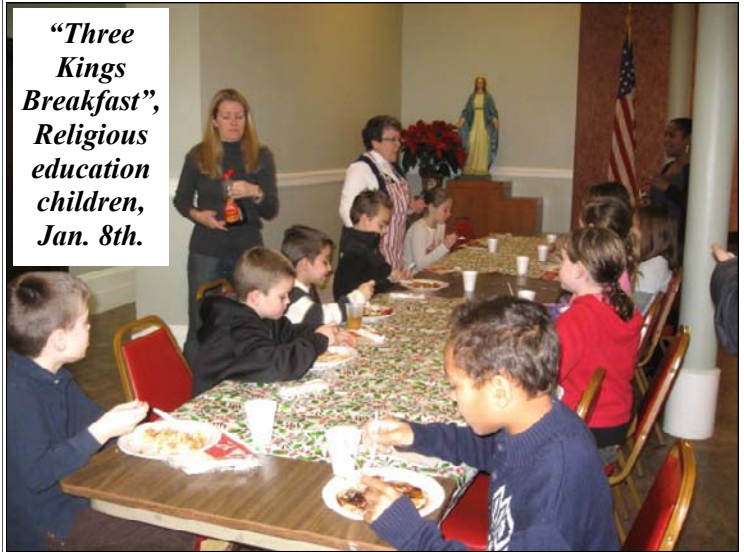
"Three Kings Breakfast", Religious education children, Jan. 8th.

Our "Holy Hour for Life" will be a silent hour of adoration before the Blessed Sacrament and will conclude with Benediction.