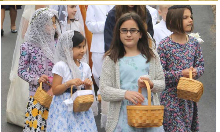
July 8th, A.D. 2018