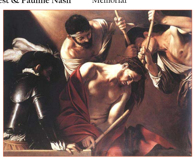
July 8th, A.D. 2018 Seventh Sunday after Pentecost / 14th Sunday of the Year Mary Immaculate of Lourdes, Newton/Needham, Massachusetts