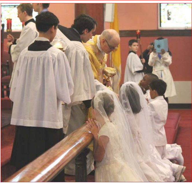
May 20th, A.D. 2018