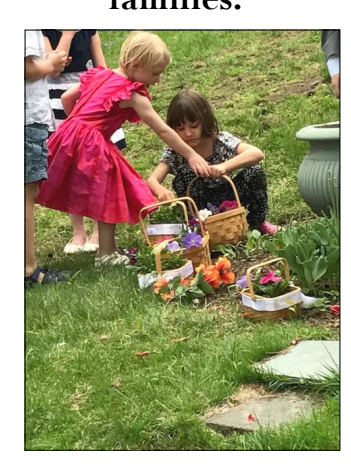
May 13th, A.D. 2018