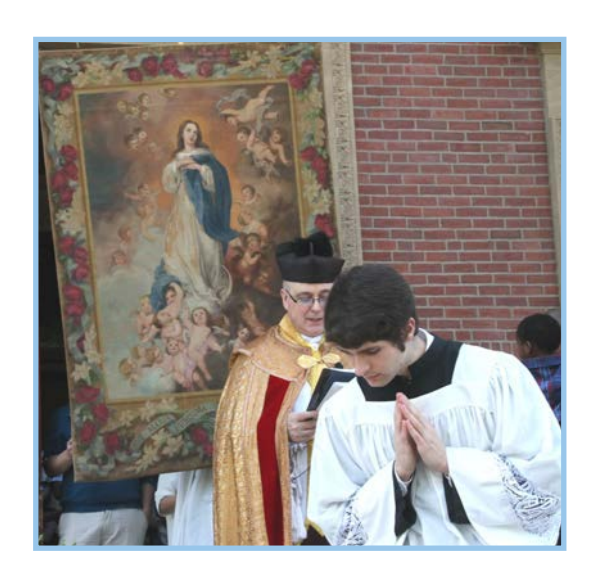
May 6th, A.D. 2018