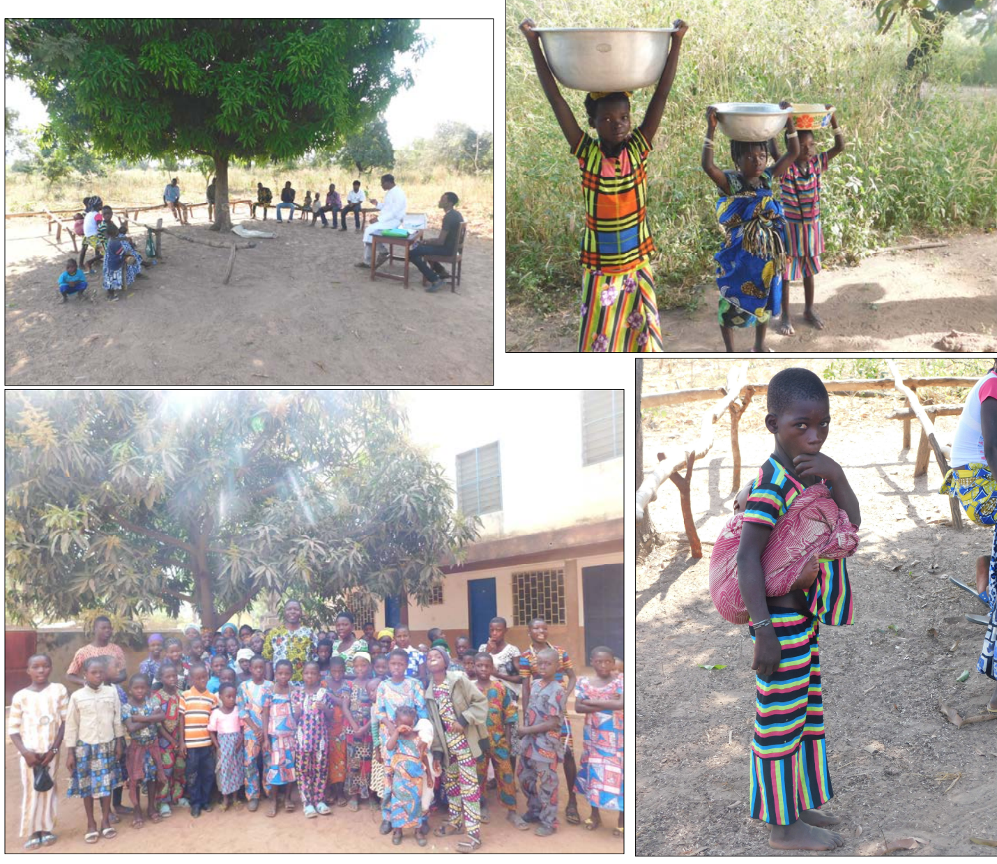
December 31st, A.D. 2017 Sunday in the Octave of Christmas/Feast of the Holy Family Mary Immaculate of Lourdes, Newton/Needham, Massachusetts