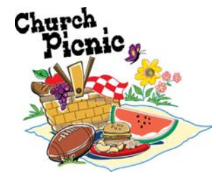
September 24th, A.D. 2017 Sixteenth Sunday after Pentecost/25th Sunday of the Year Mary Immaculate of Lourdes, Newton/Needham, Massachusetts