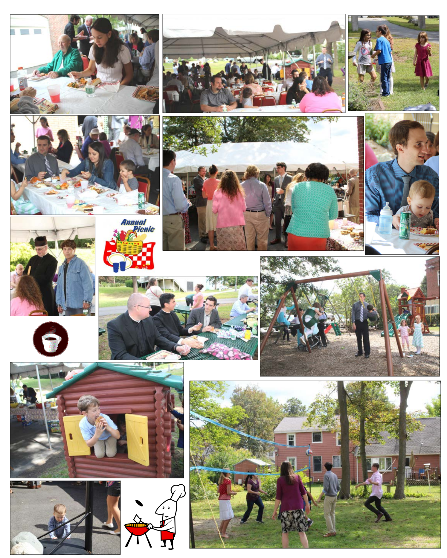
September 24th, A.D. 2017 Sixteenth Sunday after Pentecost/25th Sunday of the Year Mary Immaculate of Lourdes, Newton/Needham, Massachusetts