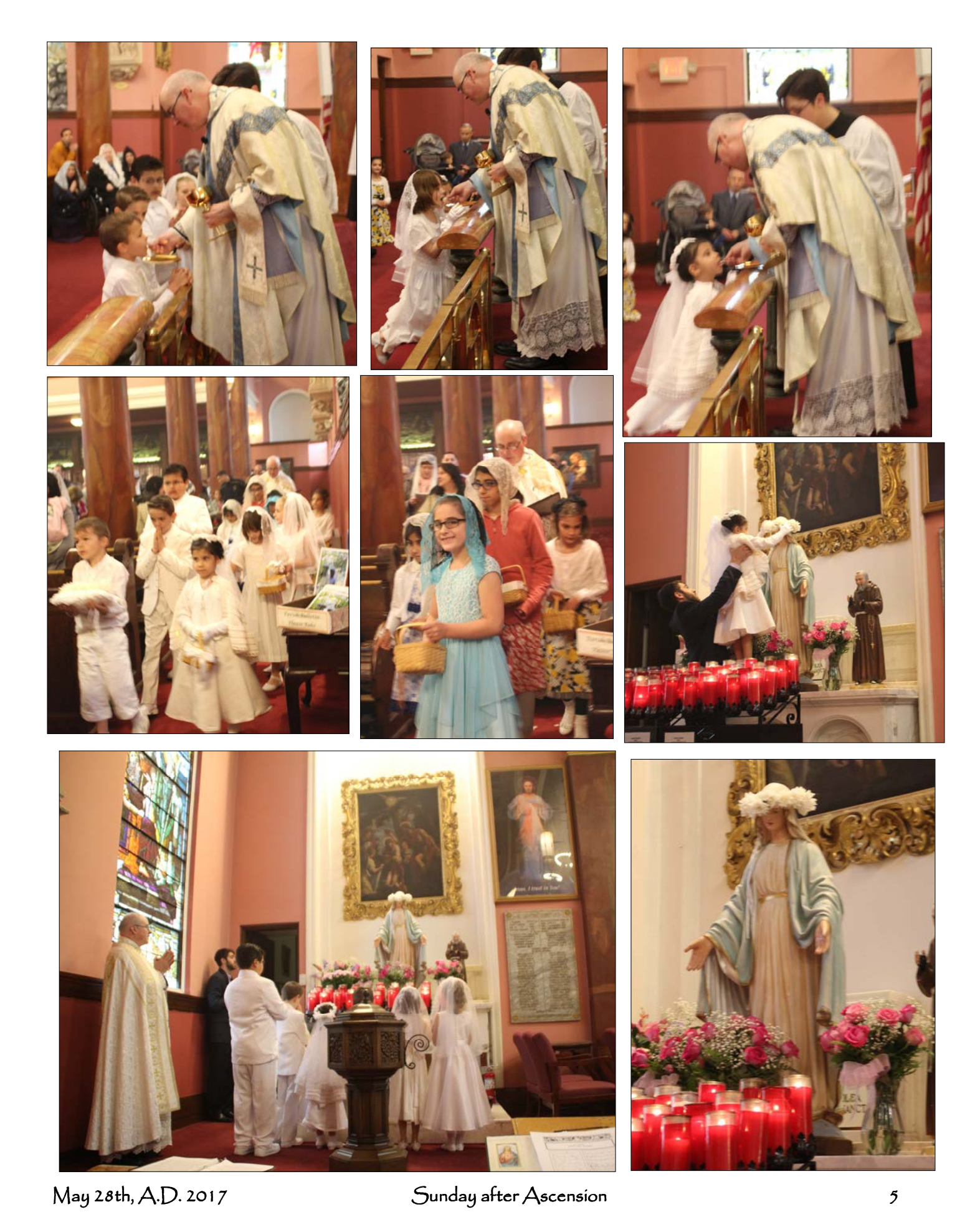
Sunday after Ascension Mary Immaculate of Lourdes, Newton/Needham, Massachusetts