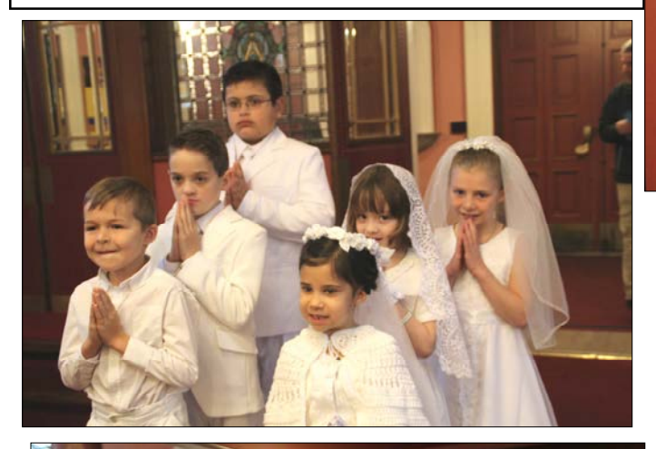
Photo Album: First Holy Communion and May Procession, May 14th, A.D. 2017