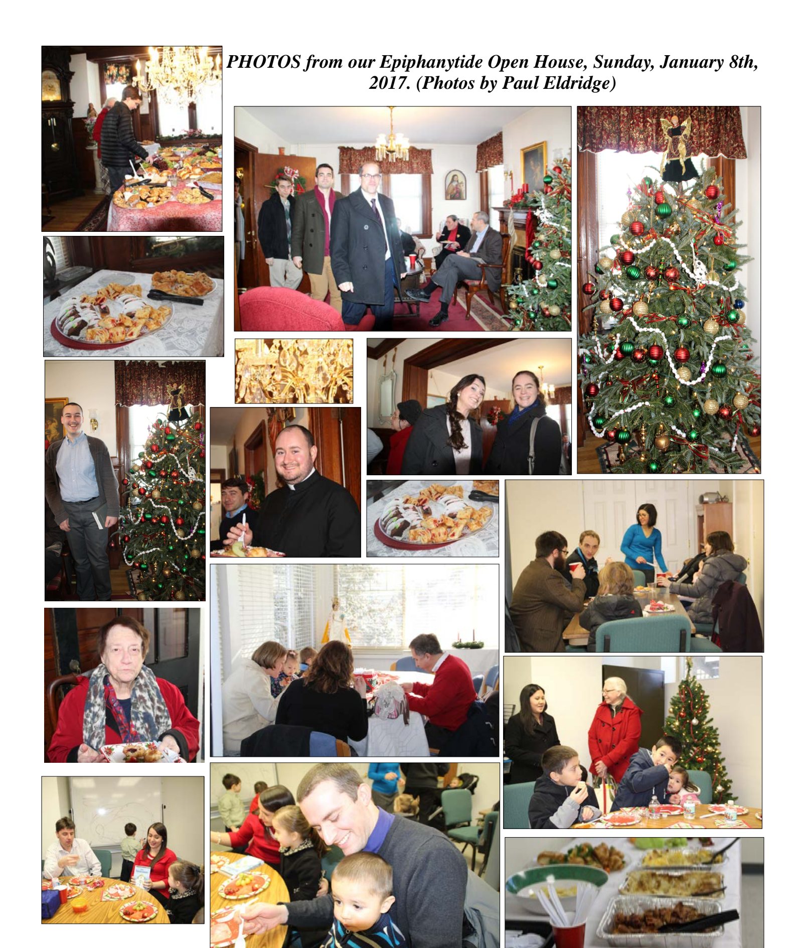
January 22nd, A.D. 2017 Third Sunday after Epiphany and of the Year Mary Immaculate of Lourdes, Newton/Needham, Massachusetts