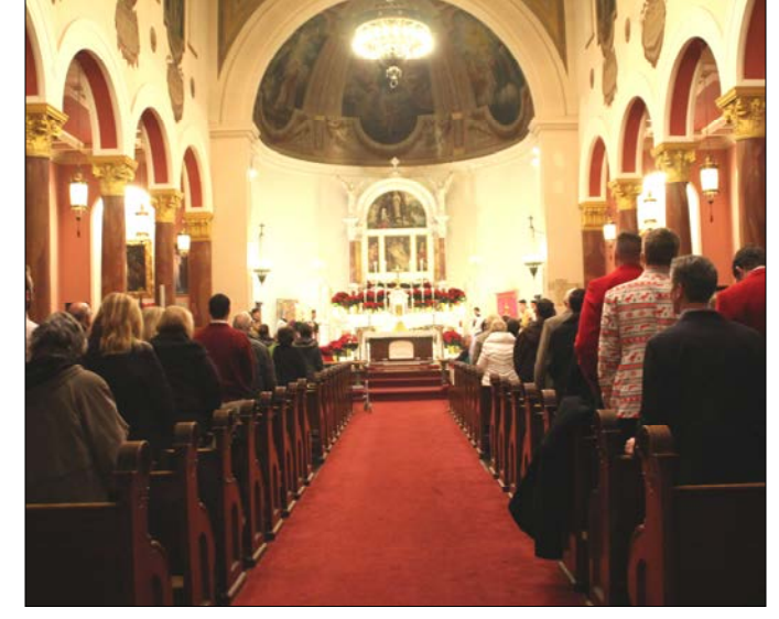
January 1st, A.D. 2017 Octave Day of Christmas Mary Immaculate of Lourdes, Newton/Needham, Massachusetts