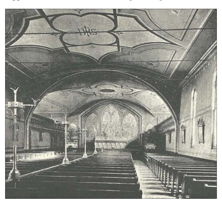
PHOTO Archive: Interior of the original parish church of St. Mary's, 1870, located on Chestnut Street, Newton Upper Falls. (The church building no longer exists.)

continue to celebrate the Christmas Season in Epiphanytide!