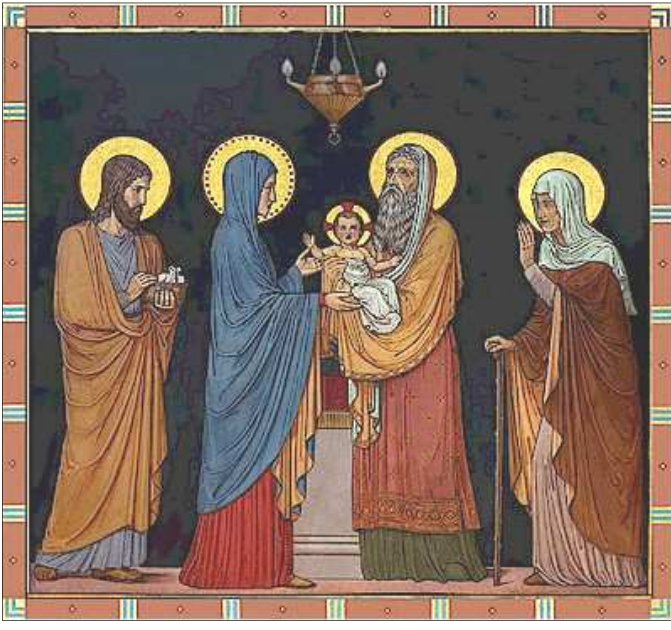
January 1st, A.D. 2017

POSTCOMMUNION May this communion, O Lord, cleanse us from all sin, and by the intercession of the blessed Virgin Mary, Mother of God, make us partakers of the heavenly remedy. Through the same our Lord.