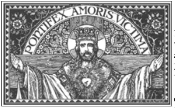
For this I was born, and for this I came into the world, that I should give testimony to the truth.