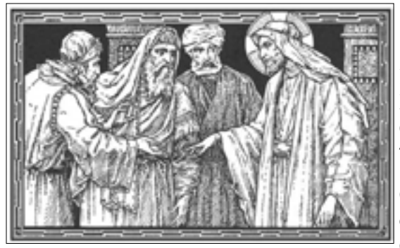
"Render therefore to Caesar the things that are Caesar's; and to God the things that are God's."