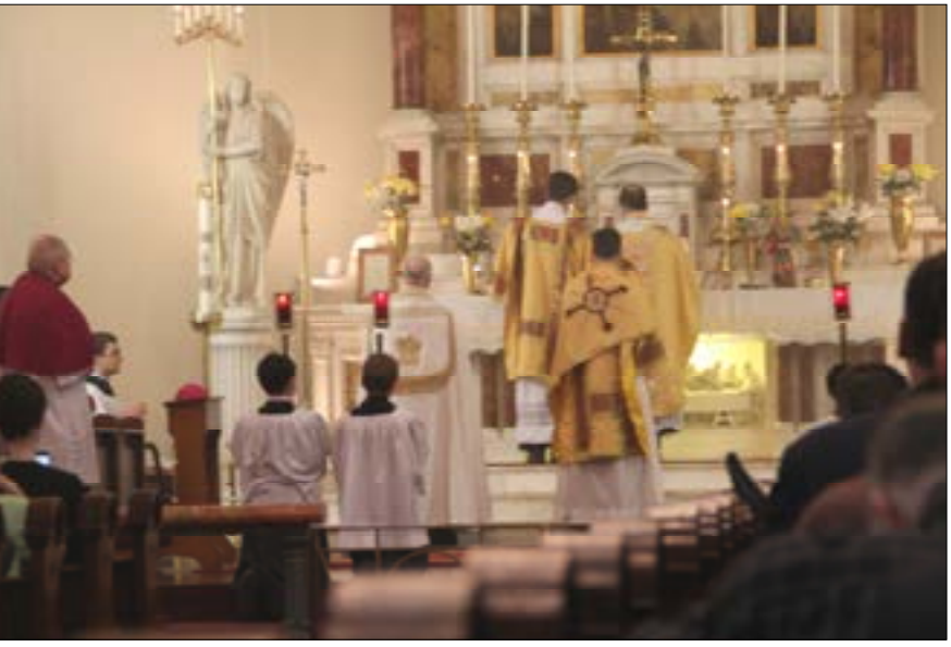
June 5th, A.D. 2016