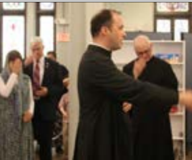
June 5th, A.D. 2016