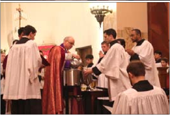
April 10th, A.D. 2016 Good Shepherd Sunday Mary Immaculate of Lourdes, Newton/Needham, Massachusetts