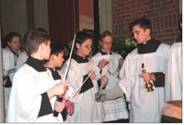
"May Thy abundant blessing come down upon this lighted Candle, we entreat Thee, Almighty God; and do Thou look upon it, invisible creator of new life, as it shines in the night; that not only the sacrifice that is offered this night may shine by the secret mixture of Thy light, but also into whatsoever place anything of this mystically blessed object shall be brought, there the power of Thy majesty may be present, and all the malice of satanic deceit may be driven out: through Christ our Lord. Amen."