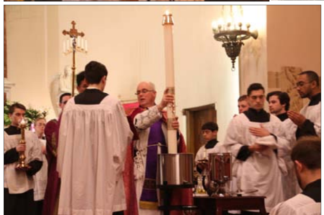
The Baptismal Regeneration and the Renewal of Baptismal Promises.