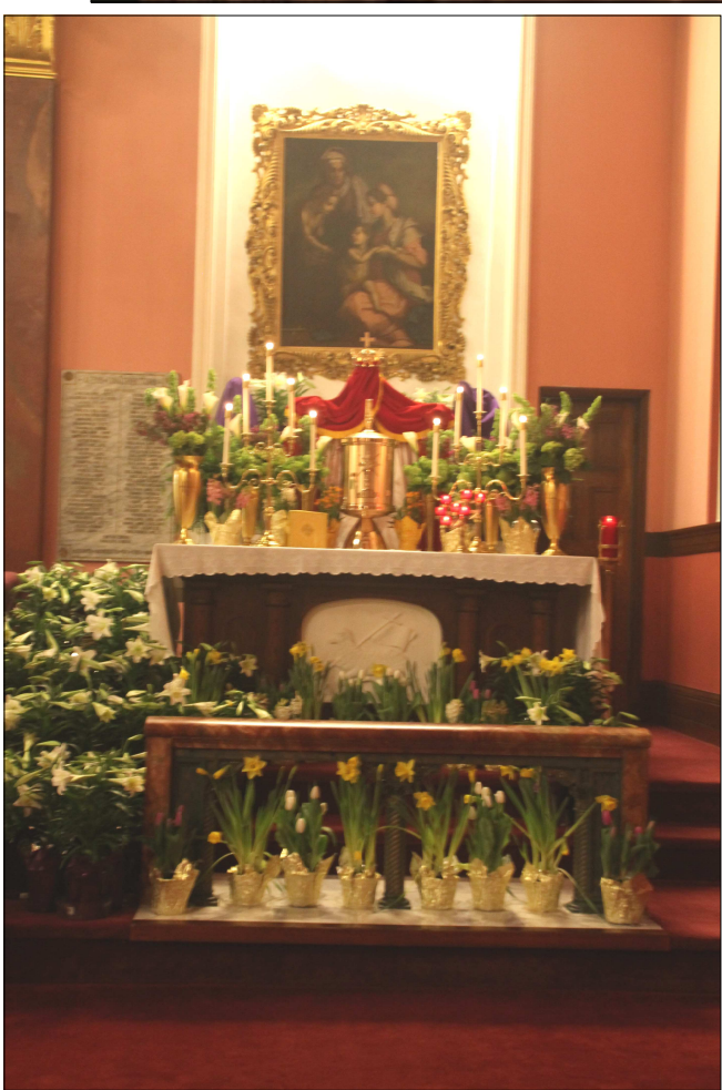
The Altar of Repose