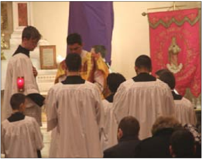
April 3rd, A.D. 2016