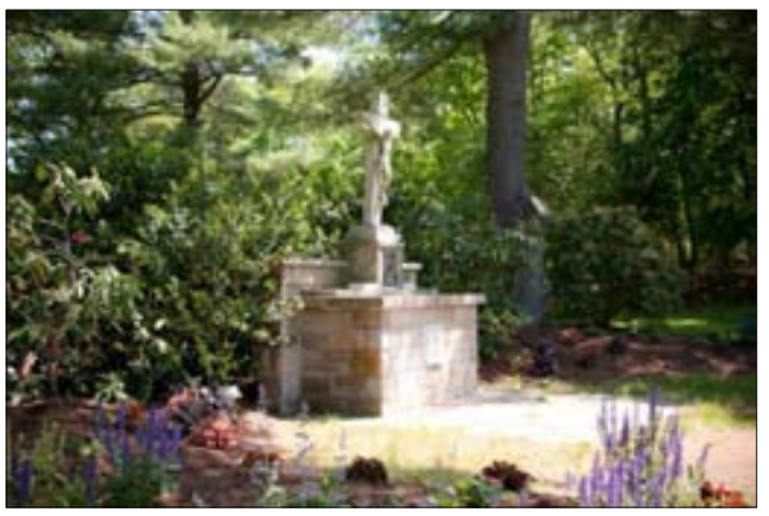
PHOTO GALLERY: Tatiana Blanco <u>www.tatianablancophotography.com</u>