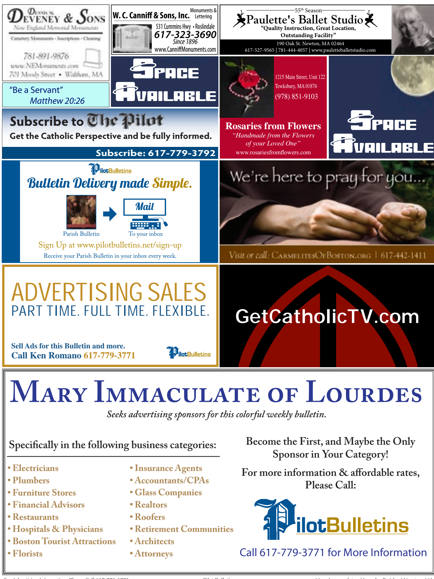
Mary Immaculate of Lourdes Parish of Newton, MA