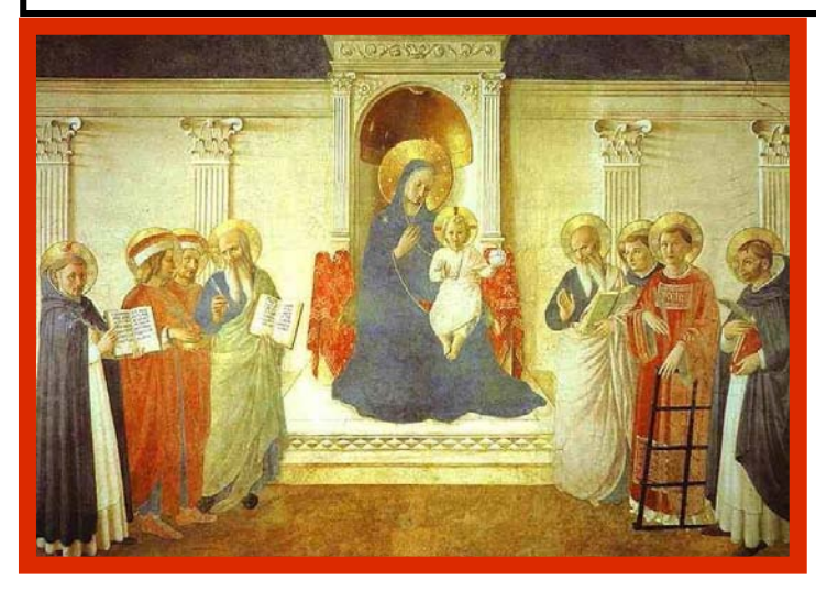
FRONT COVER: "The Madonna of the Shadows" by Fra Angelico, ca. 1450 A.D.