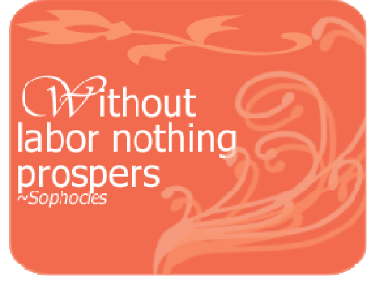
FRONT COVER: "Without labor nothing prospers" from the ancient Greek writer Sophocles—a thought for this Labor Day weekend and a reminder of the indispensable role of human effort under God's grace to effect good outcomes.)