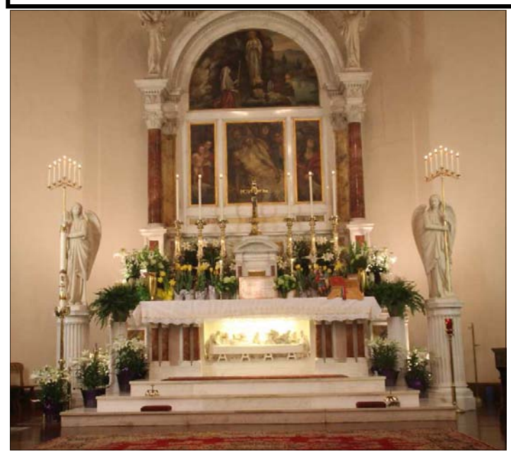
FRONT COVER PHOTO: The High Altar of the parish decorated for Easter, April 20th, A.D. 2014.