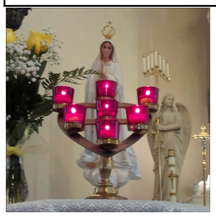
FRONT COVER PHOTO: The First Saturday Shrine set up in the sanctuary of the parish church for Fatima Devotions, March 1st, 2014. As went enter into Lent, the seven votive candles burning on the heart-shaped candleholder call to mind the Seven Sorrows of Our Lady. In the background we see two symbols of the Paschal Mystery: the Cross of Christ and the Paschal Candle of the Resurrection.