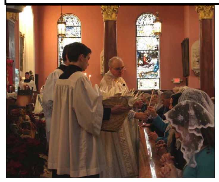
FRONT COVER: The Distribution of the Blessed Candles at the 10:30 Mass on Candlemas Day, February 2nd.