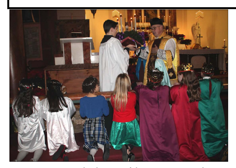
FRONT COVER: The chanting of the Roman Martyrology at the beginning of the Mass of Christmas Eve this year. The parish children who participated in the Christmas Pageant are kneeling in front of the Manger scene. "THE NATIVITY OF OUR LORD JESUS CHRIST, ACCORDING TO THE FLESH."