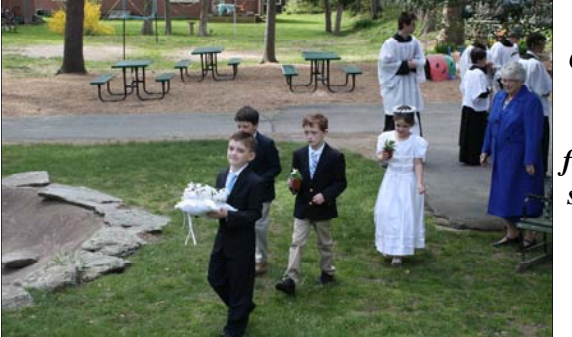
The First Communion Children bring their flowers to the shrine of the Blessed Mother.

This is a group of wonderful members of our parish who knit and crochet prayer shawls, lap robes, etc. We present these items to the housebound and sick of our parish. Please join us on the 2nd and 4th Sundays of each month following the 10:30 AM Mass in the lower rectory conference room. You may also find out how to obtain lessons in crocheting and knitting. Next Meeting: <u>TODAY</u>, Sunday, May 12th.