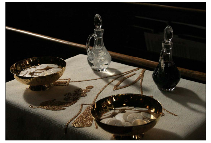
(FRONT COVER: The bread and wine of the Offertory gifts at last year's First Holy Communion Mass. Today and next Sunday, we will have children of the parish making their First Holy Communion.)