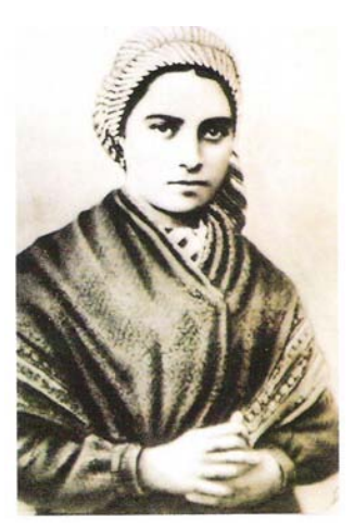
February 10th, A.D. 2013 Quinquagesima Sunday and the Fifth Sunday of the Year Mary Immaculate of Lourdes, Newton/Needham, Massachusetts