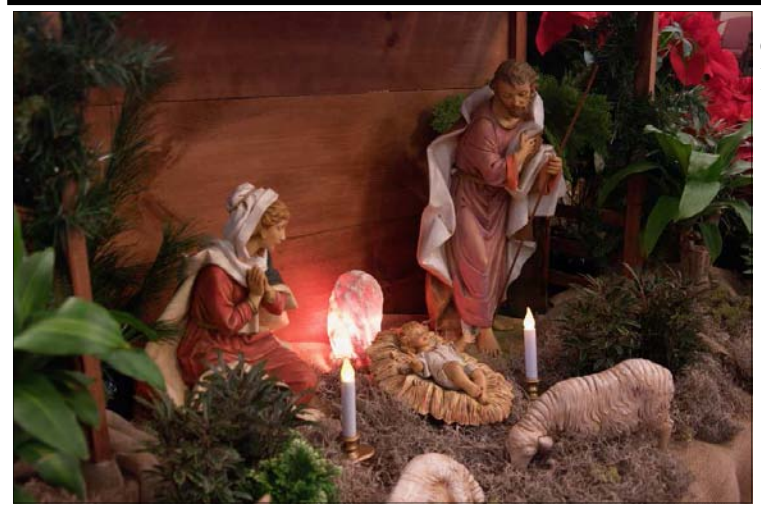
(Front cover: the Nativity scene inside our parish church. This photograph was taken from the crèche decoration of 2010.)