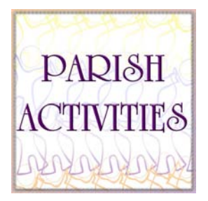
"BRING-A-SAINT-AND-LUNCH" Thursday, January 10th, A.D. 2013

CHRISTMAS VACATION for all Religious Education Classes