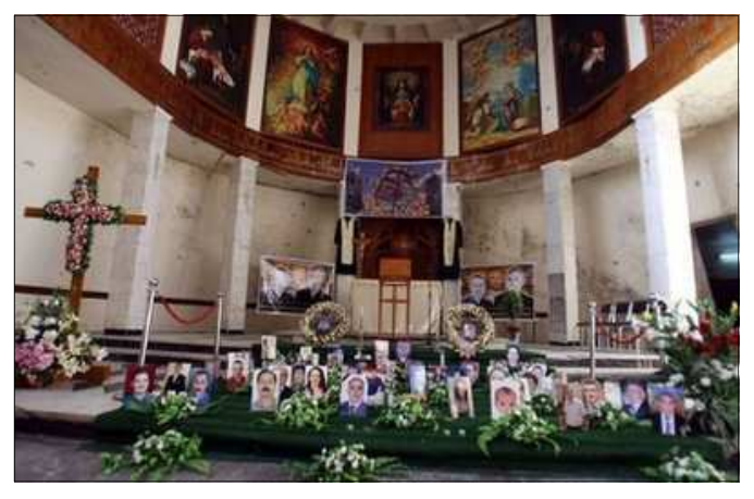
PHOTO: Our Lady of Salvation Church, Christmas, 2010. The shrine of photographs before the altar is of those murdered by the attack on October 31st, 2010.

2003, the native Christians of Iraq, who trace their faith back to the preaching of St. Thomas the Apostle, have been the targets of Islamist fanaticism.