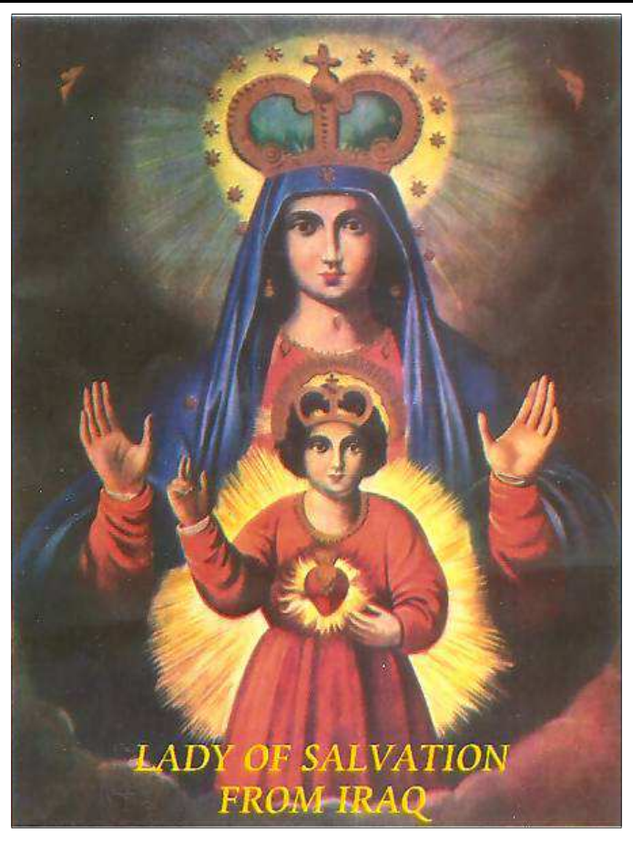
(Front Cover: Painting of 'Our Lady of Salvation' from the Syriac-rite Catholic Cathedral Our Lady of Salvation in Baghdad, Iraq.)