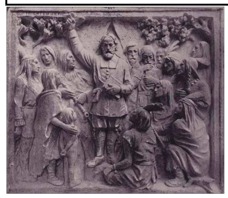
(Front Cover: Bas-relief of the Puritan minister John Eliot, the "Apostle to the Indians", preaching the Gospel to the Indians in their own Algonquin language at Chief Waban's Wigwam (Newton), 1646. First Parish Church of Boston.)