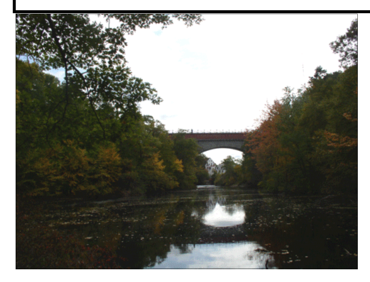
(Front Cover: Photograph of Echo Bridge over the Charles River, the Newton village of the Upper Falls at autumn time. The Charles River is at the foot of the Elliot Street hill, on the way from our parish church to our parish cemetery of St. Mary's on the Needham/Wellesley town line.)