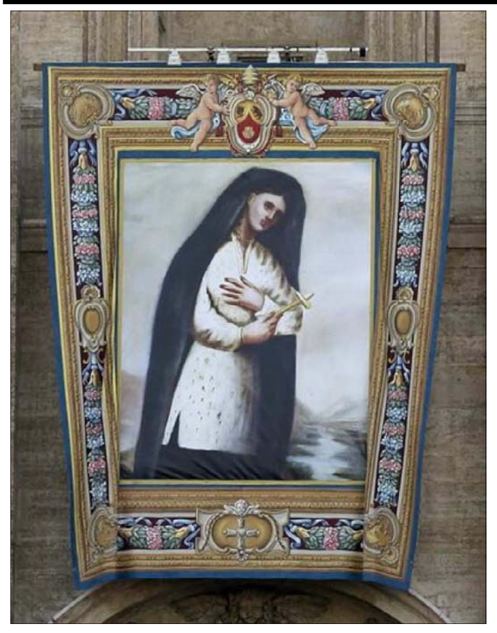
(Front Cover: Photograph of the tapestry of St. Kateri Tekakwitha hanging from the balcony of St. Peter's Basilica in Rome at the Mass of Canonization last Sunday, October 21st, A.D. 2012. Kateri was 'raised to the altars' with six other saints by Pope Benedict XVI.)