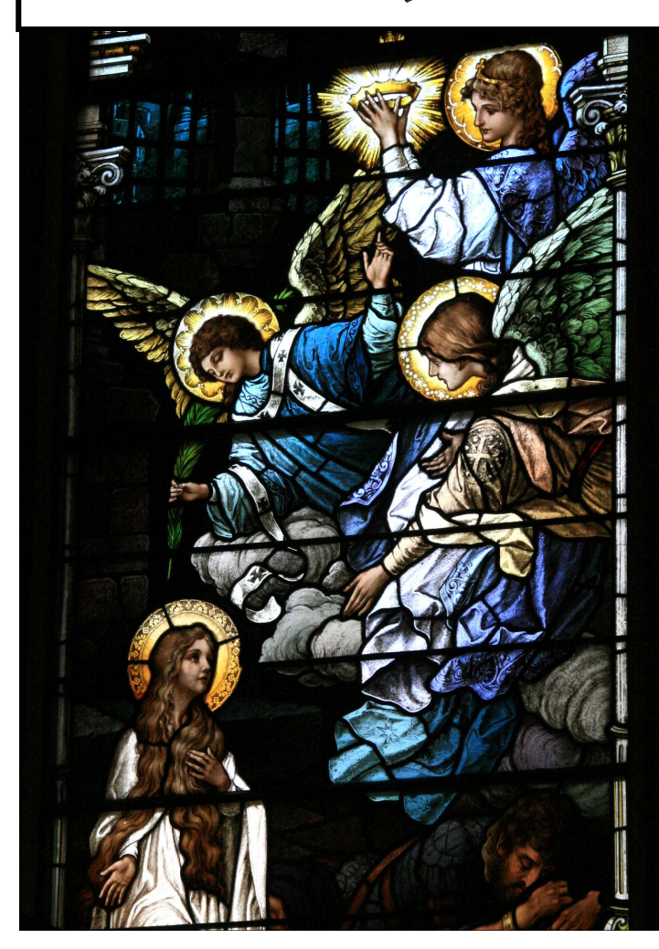
(Front Cover: The child-martyr St. Agnes receives the heavenly crown. This scene is depicted on the stain glass window of our church by the confessional on the rectory-side. It was dedicated by the mission chapel of St. Joseph's, Needham. At the time this church was built—1910—St. Joseph's in Needham was not yet its own parish, but a mission of Mary Immaculate of Lourdes. St. Joseph's became its own parish in 1917.)