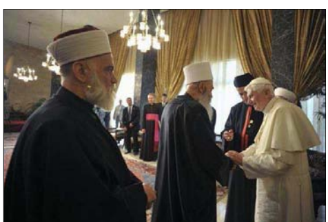
PHOTO: Pope Benedict XVI meets Muslim religious leaders in Beirut, Lebanon, last week.

NEWTON UPPER FALLS HERITAGE DAY SUNDAY, SEPTEMBER 23rd, 2012: 3-6 p.m. Emerson Playground (Emerson Community Center in case of rain)