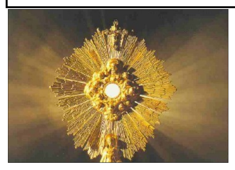
(Front Cover: A golden monstrance with the white Host of the Blessed Sacrament: on the Thursday after Trinity Sunday, the Church celebrates the feast of God Himself in the Holy Eucharist. In the USA the observance of Corpus Christi is always transferred to the Sunday after Trinity.)