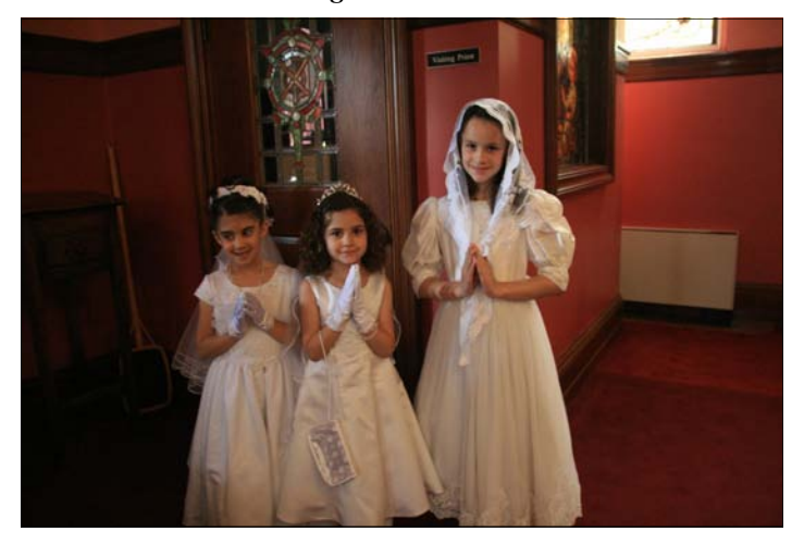
Children of Mary's court in the May Procession to the parish gardens.