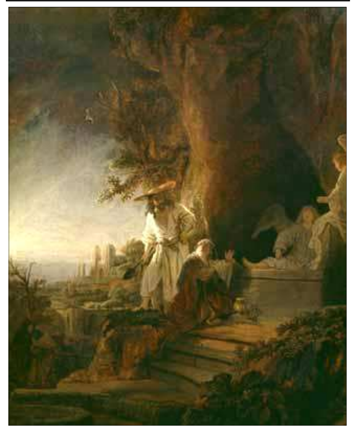
(Front Cover: "Christ and St. Mary Magdalene at the tomb", by Rembrandt Van Rijn, A.D. 1638.)