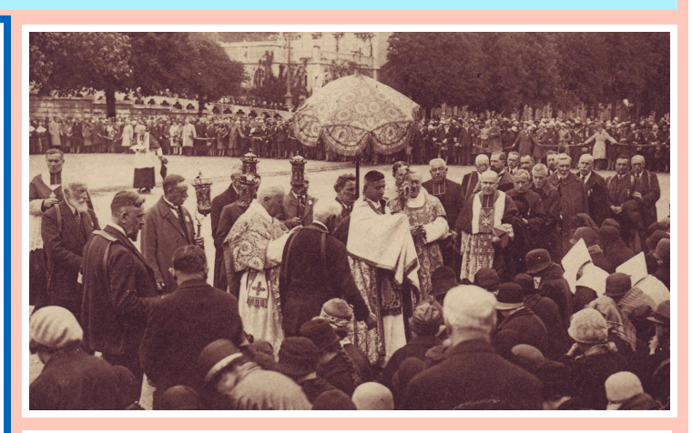
Photo: The Blessing of the Sick at Lourdes with the Holy Eucharist (1920s). The miracles of healing at Lourdes typically occur not at the baths themselves but later on during the Procession of the Blessed Sacrament.

day, I call upon thee and seek thy aid. Thou who on this earth didst always fulfil God's designs, help me to do the Holy Will of God. Beseech the Master of Life, from Whom all paternity proceedeth, to render me fruitful in offspring, that I may raise up children to God in this life and heirs to the Kingdom of His Glory in the world to come. Amen.