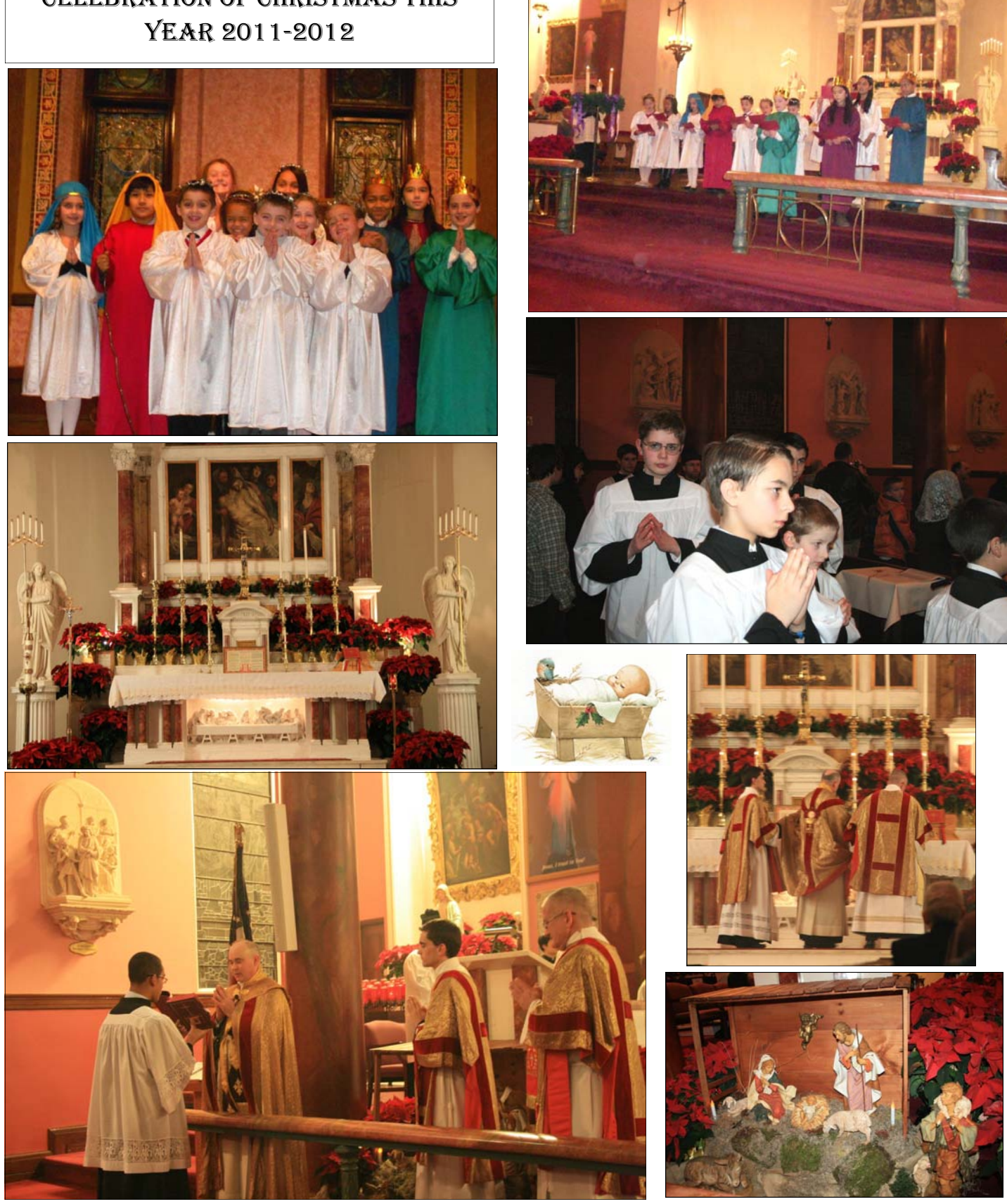
January 29th, A.D. 2012 Mary Immaculate of Lourdes, Newton/Needham, Massachusetts

SCENES FROM OUR PARISH CELEBRATION OF CHRISTMAS THIS YEAR 2011-2012