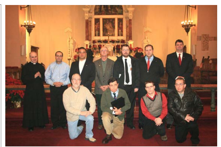
Photo the parish Holy Name Men's Group after the induction of new members, January 15th, 2012.