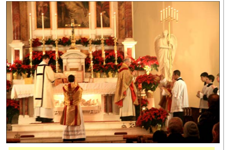
SCENES FROM OUR SOLEMN HIGH MIDNIGHT MASS, 2011:

(Top) The Chanting of the Roman Martyrology by the Christmas Crib; (Middle) The beginning of the Gospel Procession; (Bottom) The Offertory.